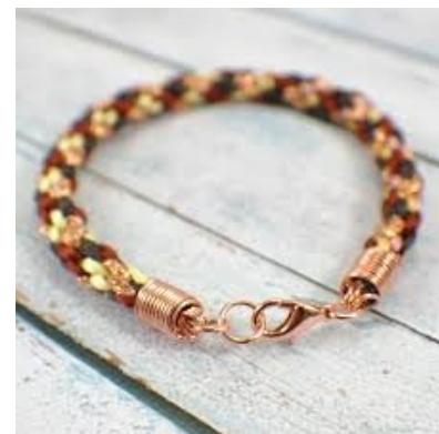
Copper Kumihimo Bracelet