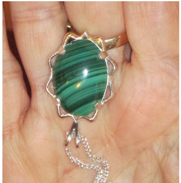
Top Right. The gift table. Right. Beverly got this malachite necklace.