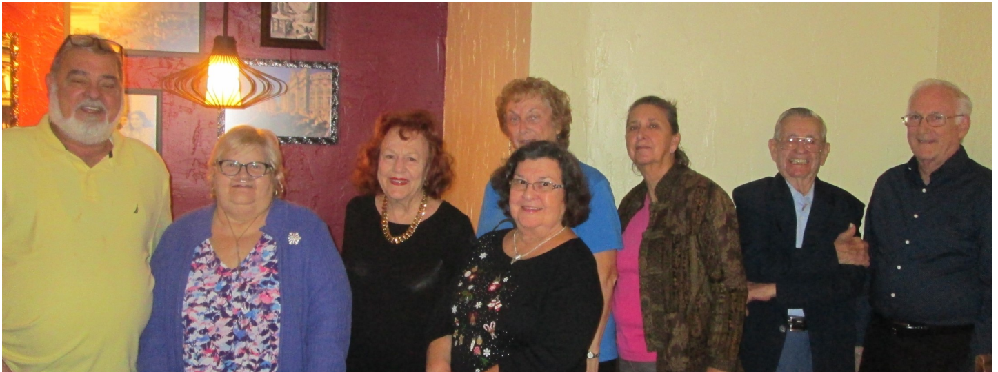
2022 CBRGC Officers and Board Members