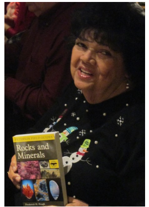
On December 2, CBRGC Members and guests met at Olive Garden on Merritt Island for dinner and gift exchange.