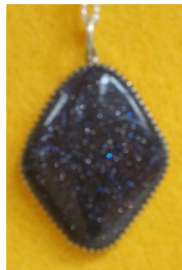
Right: Sterling Silver pendants created by Curt. Highly polished Blue Goldstone and lovely Picture Jasper. Curt shaped and polished the stones.