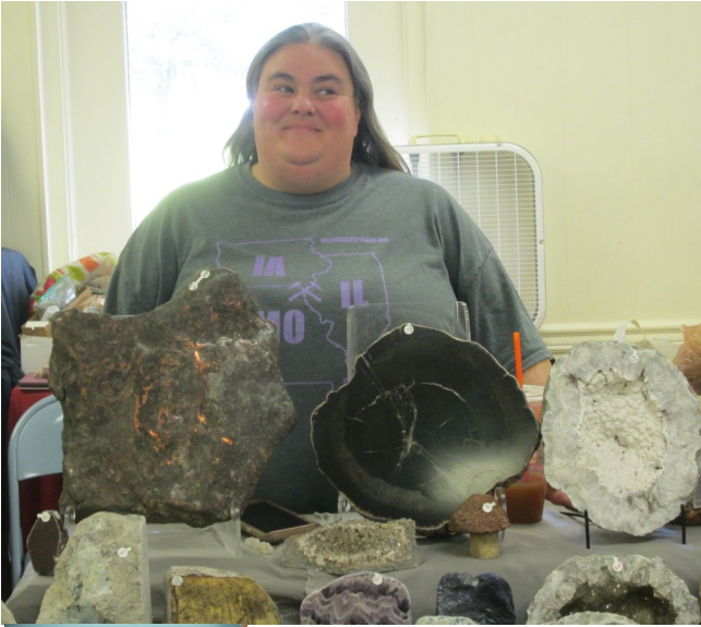
WWW.FABULOUSKEOKUKGEODES.COM YouTube: Woodies Rock Shop Facebook: @fabulouskeokukgeodes