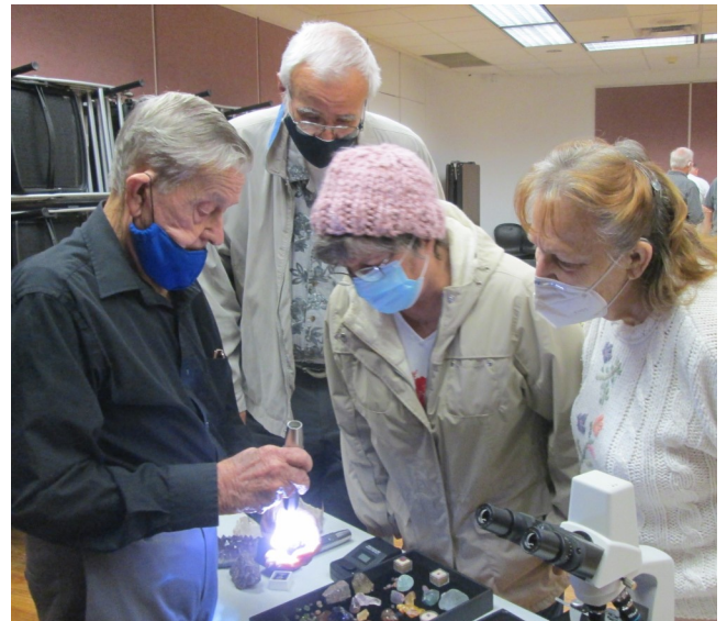
Above: CBRGC member and presenter Bill demonstrating how the UV light can be used to separate natural gems from synthetic. We all learned a lot.