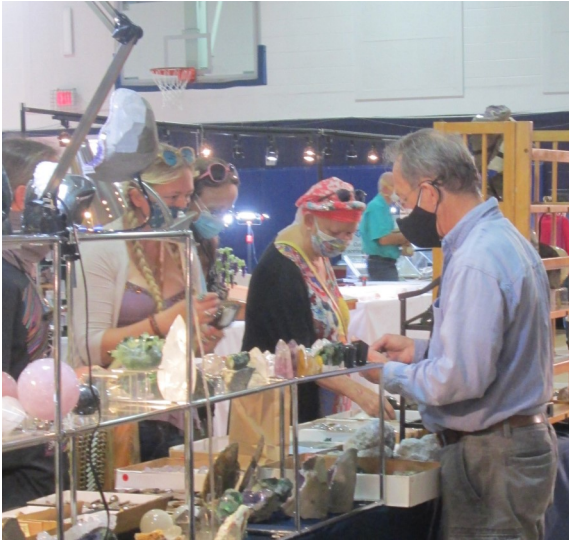
RARE EARTH MINERALS Lake Mary, Florida