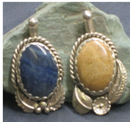
SOUTHWEST JEWELRY—Two pendants with Lapis and Jasper cabochons.