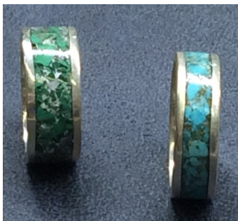
INLAY—Above are two rings.