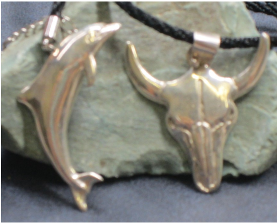
CASTING— Porpoise and a Buffalo head.