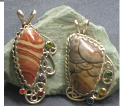
MOTHERS PENDANTS—Wonder Stone and Jasper.