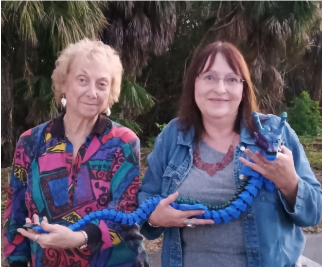
The two grand prize winners.