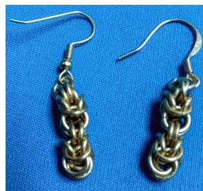
Byzantine Earrings by Rhonda