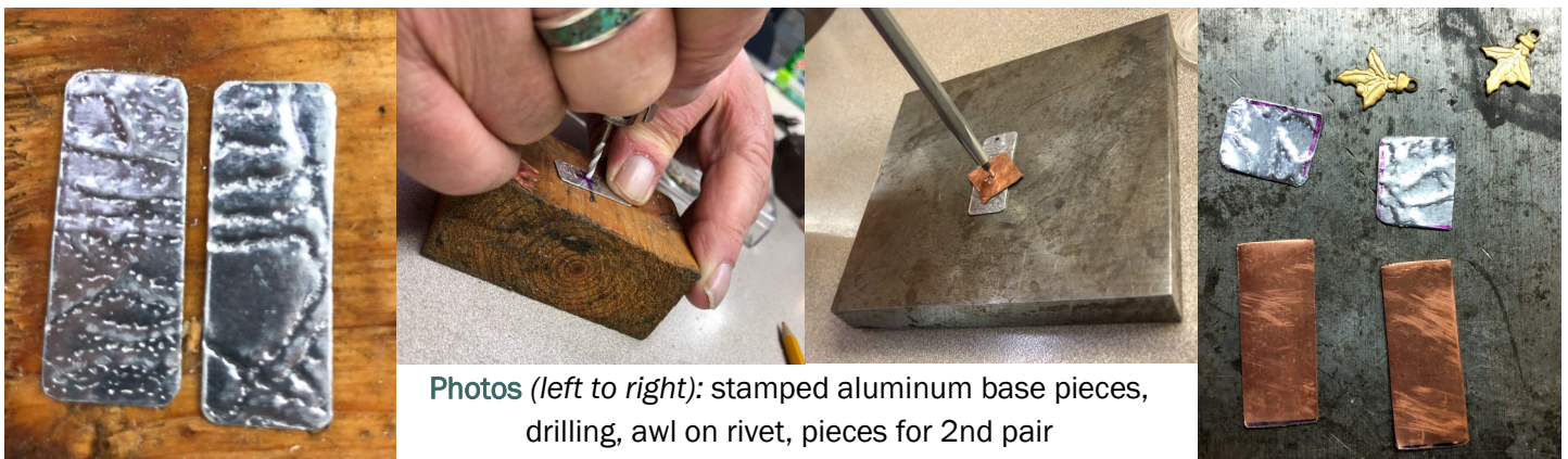
Photos (left to right): stamped aluminum base pieces, drilling, awl on rivet, pieces for 2nd pair